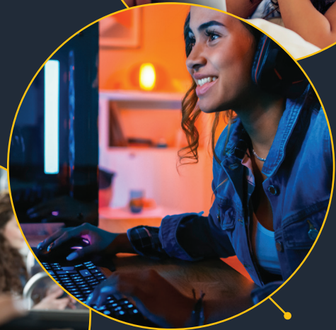
IDENTITY THEFT PROTECTION